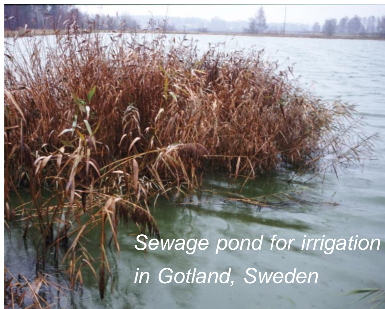
Sewage pond for irrigation in Gotland, Sweden