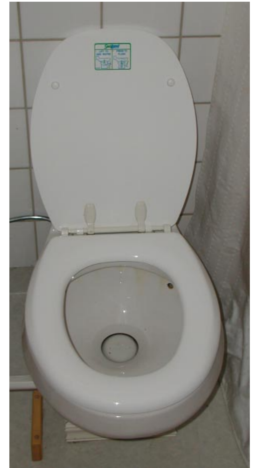
A vacuum toilet

G reywater is treated separately, e.g. in a filter bed