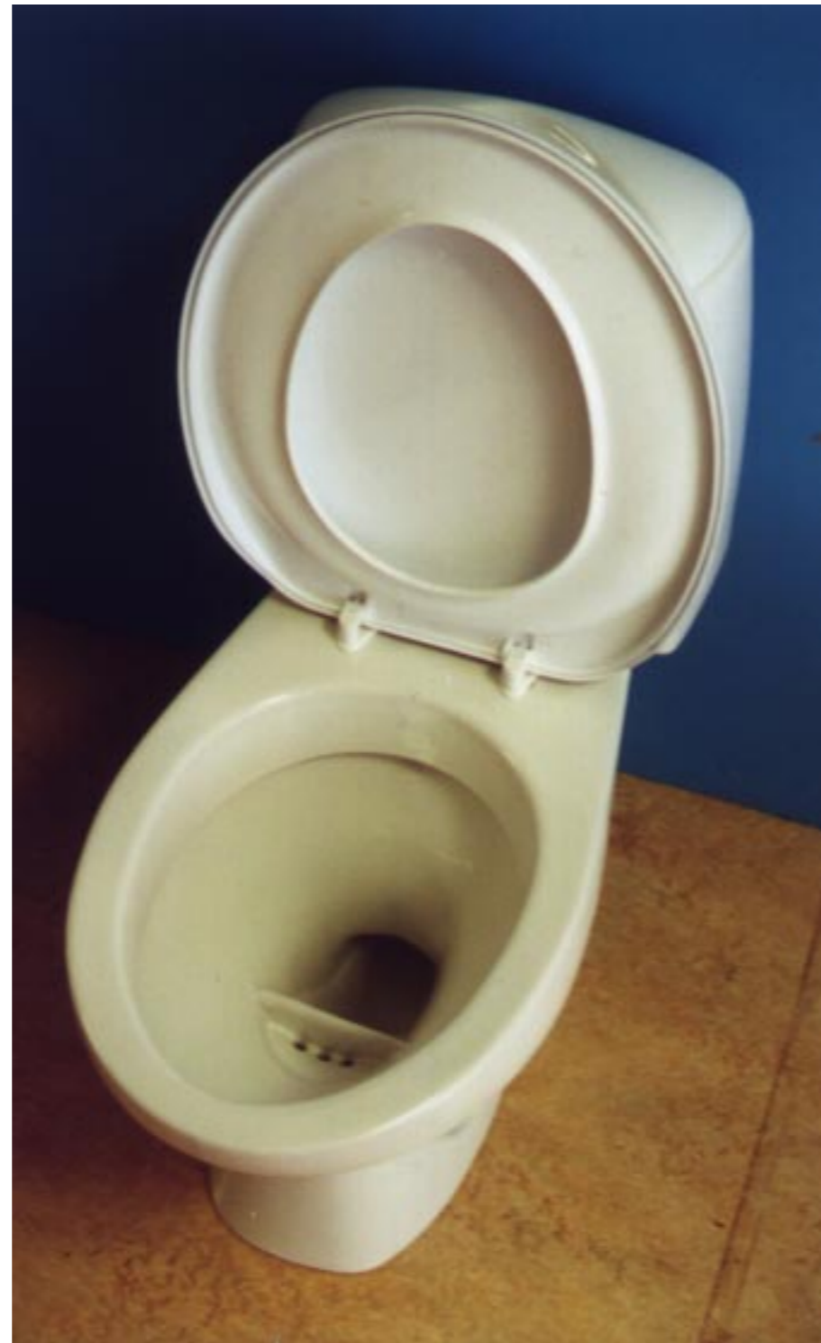
A urine diverting toilet. Urine is collected in the front bowl.

W ith dry handling of faeces, usually low costs