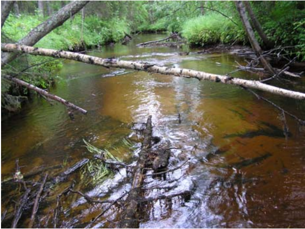
Figure 1. Large Woody Debris in Tämälven, Sweden (Picture Erik Degerman, 2008)