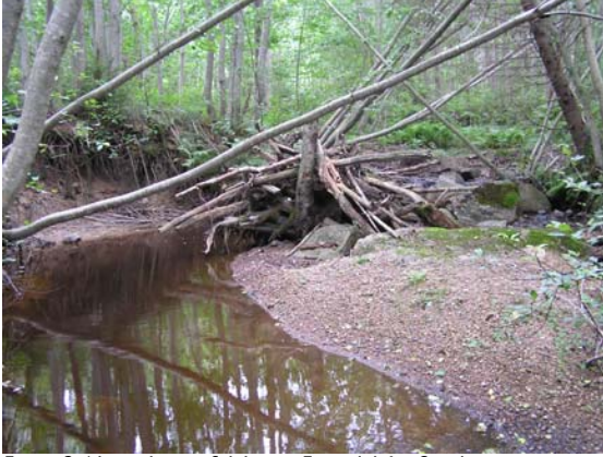
Figure 3. Natural jam of debris in Frösvidalsån, Sweden.

- Where possible it is recommended to place the LWD counter to the water flow to increase the likelihood of it creating suitable fish habitat but also so that the LWD stays in place. (In Sweden 85% of intentionally added LWD in watercourses stay in place, however it is often needed to secure the LWD by means of using wires, stones etc)